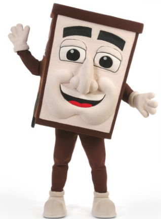
CAPTAIN CURBY SM

Bulk items are items such as appliances, furniture and other large waste materials that don't fit in your mint green bags. The City of St. Johns holds a free cleanup event each spring. If you need to dispose of a bulk item at another time, Granger can pick it up for an additional fee. To arrange collection, contact Granger at 1-888-947-2643 at info@grangernet.com .